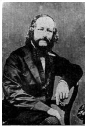
THE LATE REV. W. COLENSO.