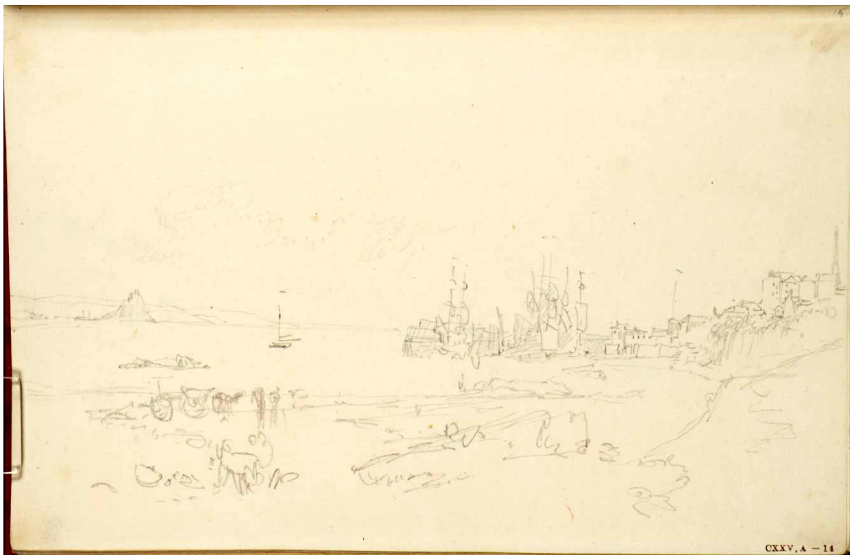
JMW Turner: Mount's Bay and Penzance Harbour 1811. Cornwall and Devon sketchbook. Tate Gallery. Sketched during Turner's tour of Cornwall in the year William Colenso was born in Penzance and the Duke of Wellington was winning in Cuidad Rodrigo.