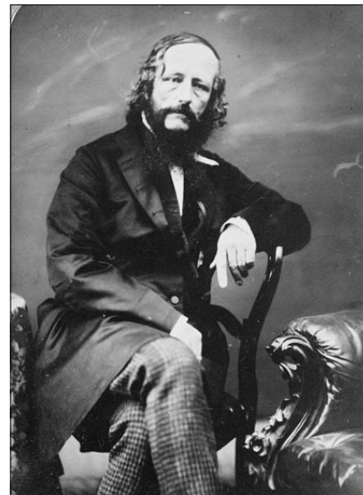
Above left: William Colenso MHR in 1861 (detail from shield at left. The image, reversed in the original ambrotype, has been corrected, the tie lappet to right)