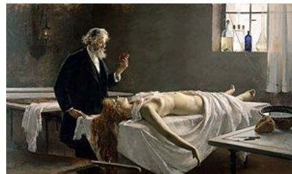
Enrique Simonet: La Autopsia , 1890.