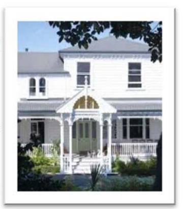
Balquhidder House, Napier

Subsequent newspaper reports of Napier Golf Club events suggest the complaints did not deter them from the royal game, however.